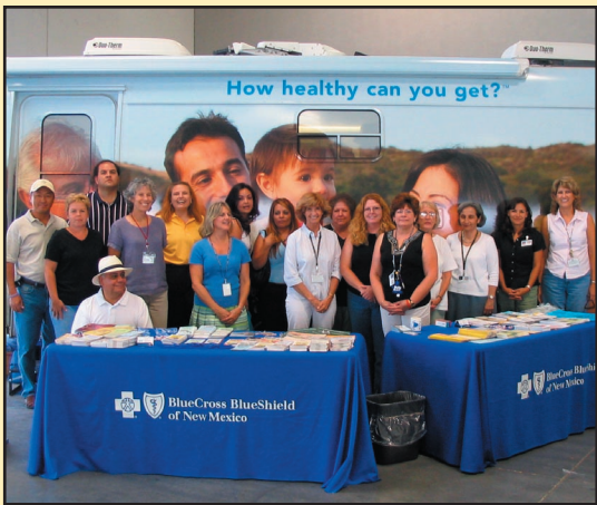
Shots for Tots to Teens volunteers in front of the Blue Cross Blue Shield Care Van used at the Karl Malone Superstore. The dealership participated as both a clinic site and a sponsor.

2/15, NMIC Steering Committee meeting, 2:30-4:30